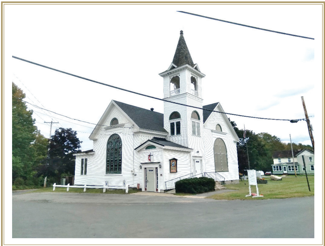
PARK UNITED METHODIST CHURCH, PROSPECT, TOWN OF TRENTON