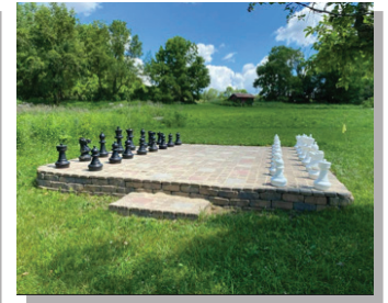
A GIANT CHESS SET ON THE GROUNDS BEHIND THE BARN