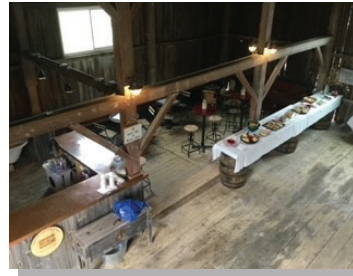
THE SECOND FLOOR OF THE HARRY'S BARN