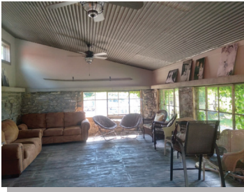
THE ORIGINAL SEED OFFICE