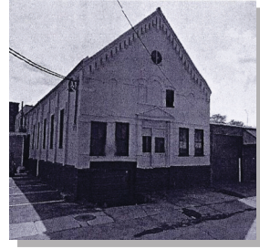
GERMAN TURN VEREIN HALL, 509 LAFAYETTE STREET

What was one of Utica's most vibrant major East-West commercial thoroughfares has been gradually and unnecessarily transformed into an uninviting disconnected out of place back alley (complete with dumpsters, loading docks, storage tanks, generators and surface parking) for adjacent hotels, parking garages, the City Hall campus, and the MVHS downtown hospital campus currently under construction.