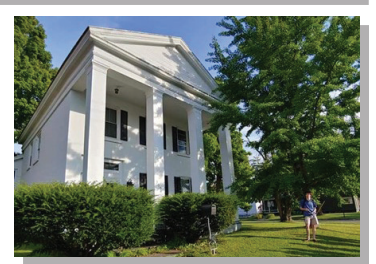
A new feature --Historic Homes of America (from Facebook)